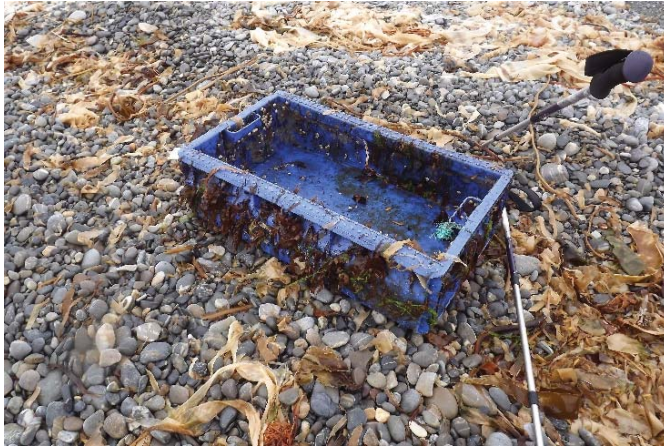
Fig. 3. Fishing box with overgrowth ( Mytilus sp., Lepas anatifera , Eucratea loricata , Gastropoda eggs, Semibalanus balanoides and Ectocarpales), beach between E and F transects.