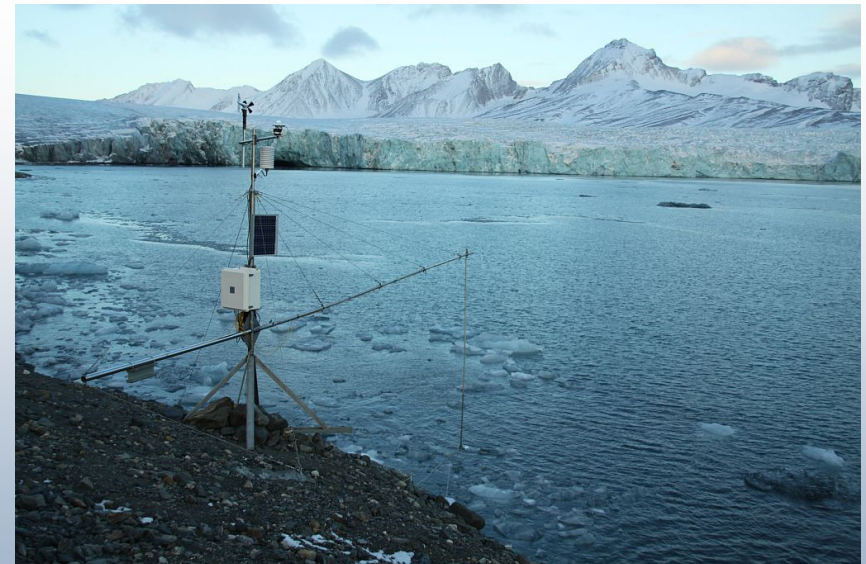
Automatic Weather Station in Hornsund