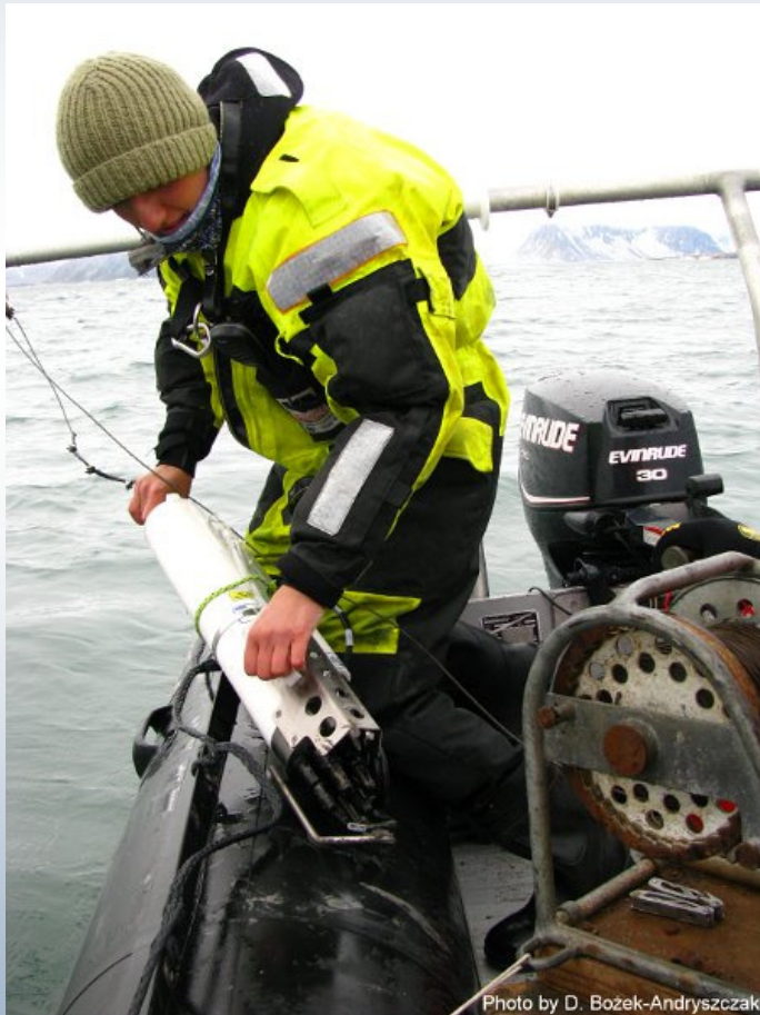
Hydrographical measurements in Hornsund